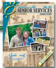
Jacksonville Senior Services Directory 2006-2007