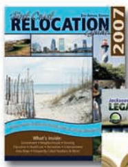
First Coast Relocation Guide 2007